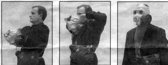
Fig.3. a b c

Upon receipt of the specific order given through mass media proceed in the following way (see Fig.3):